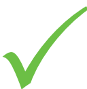
Fig. C - Back label will be marked with a green checkmark - OK for use.