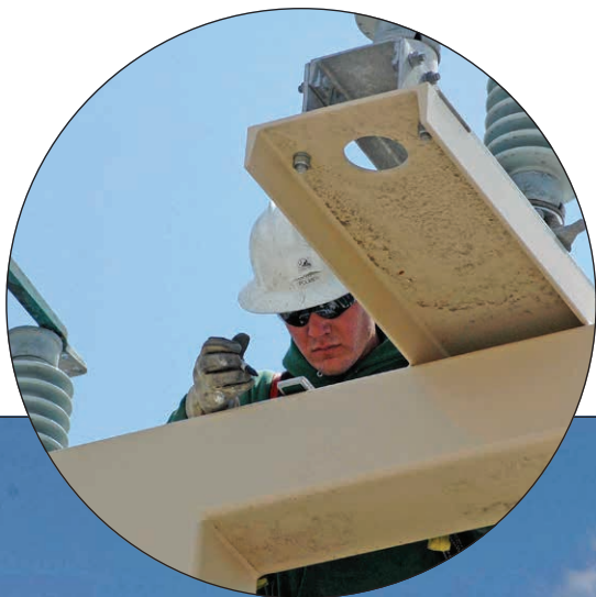
Jesse Folmer is laying out for attachments.

Local 1245 members at Sierra Pacific Power were at work last spring preparing to install a new transformer and four new feeders at Greg Substation on Purina Drive in Sparks, Nevada. The additional capacity will help the utility keep up with new growth in the area and the increased electric demand that comes