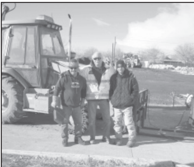
City of Fernley employees, members of IBEW Local Union 1245, put in 20-hour days cleaning debris and pumping water following the levee breach in January.

... everybody, that is, except the people who actually do the work.