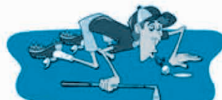
CLOSEST TO THE HOLE!