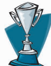
BBQ, RAFFLES AND AWARDS IMMEDIATELY FOLLOWING!

On Saturday, October 18 th , Local 1245 will hold its 22nd Annual Golf Tournament. Registration will begin promptly at 6:30 a.m. It will be a shotgun start at 8:00 a.m. If you don't have a 4-Some, we will assign you or your group to a 4-Some. BBQ and awards after the tournament at the Union Hall (30 Orange Tree Circle, Vacaville (behind Home Depot)).