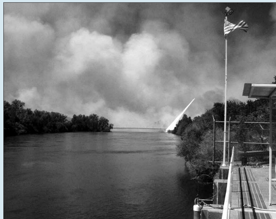
Plumes of smoke from the Redding fire billow over the Sacramento River, with the Sundial Bridge in the background.