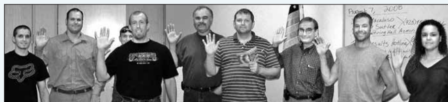
Wellington employees (top) take the IBEW obligation at the yard before heading out to work. A diverse group of members (above) take advantage of an opportunity to take the IBEW obligation at Weakley Hall.