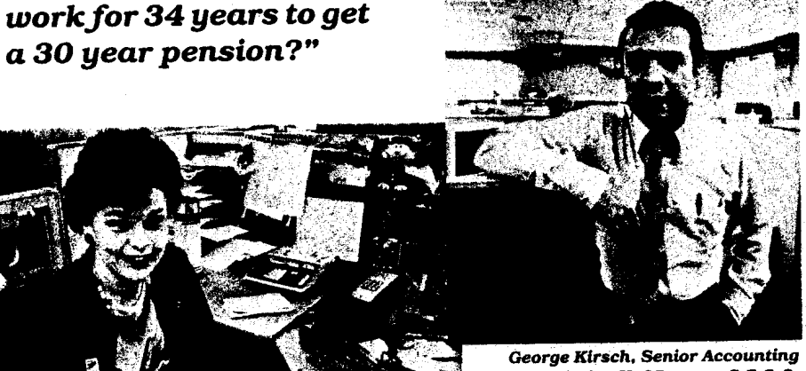
Clerk — II, 25 years, S.F.G.O.

I joined the PG&E family nearly 21 years ago. I have filled a variety of clerical positions over the years and experienced many changes and challenges. Probably the most traumatic to date being several years of dealing with the public when soaring price increases in utility costs began to bring about hundreds of irate customer calls daily . . . . We took the brunt of their frustration . . . . To be told we are overpaid as clerical workers especially in view of wage increases already granted throughout the company, not only seems absurd but blatantly discriminatory. It deeply saddens me and my coworkers that our company leaders hold us in such low esteem . . . .