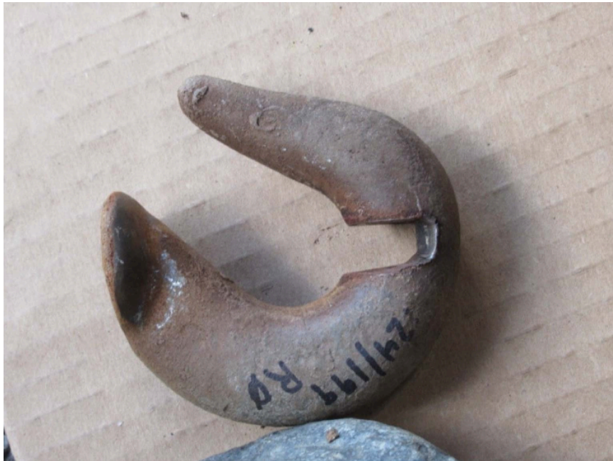
25 The deep gouging of a C-hook, caused by many decades of 26 swaying in high wind (Dkt. No. 1123, Exh. A).

7 While hazard trees threaten the distribution lines, a different set of dangers plague 8 PG&E’s transmission towers, those tall steel towers that rise far above the tree tops (so 9 there’s no risk of trees falling on the lines). For transmission towers, the problem is 10 defective and worn-out hardware on the towers themselves. The Butte County fire, for 11 example, started because an old C-hook had become so deeply gouged from decades of 12 swaying against the plate on which it hung that the C-hook simply broke and fell, 13 causing the attached power line to fall onto the metal tower, spewing sparks onto the 14 wind-blown dry grass below. (And, as mentioned, just two miles away, minutes after 15 C-hook failure, a tree blew onto a nearby PG&E distribution line, igniting a second 16 source for the conflagration.)