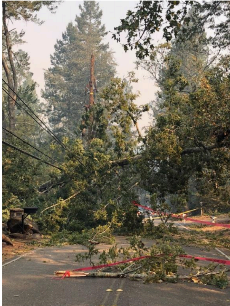
A fallen tree blown onto a de-energized PG&E distribution line (Public Safety Power Shutoff Oct. 26–Nov. 1, 2019 Report, Appx. C, Fig. 6).

Here is a photograph of one such wind-blown tree that, but for the PSPS, would likely have caused a wildfire: