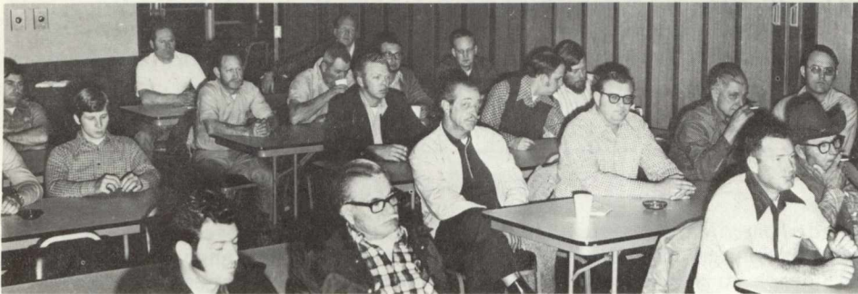
Shown above are some of the members employed by the City of Redding. See page seven for more photos.