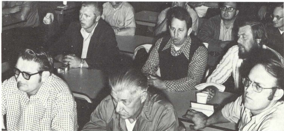
Shown above are members employed by the City of Redding attending a meeting on March 18th in order to develop their proposals for upcoming negotiations.