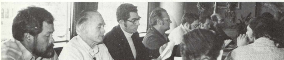
Shown above and below are stewards at the S.F. and N. Bay Training Conference.