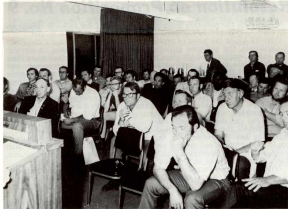
This is an overall view of some of those attending the East Bay meeting.