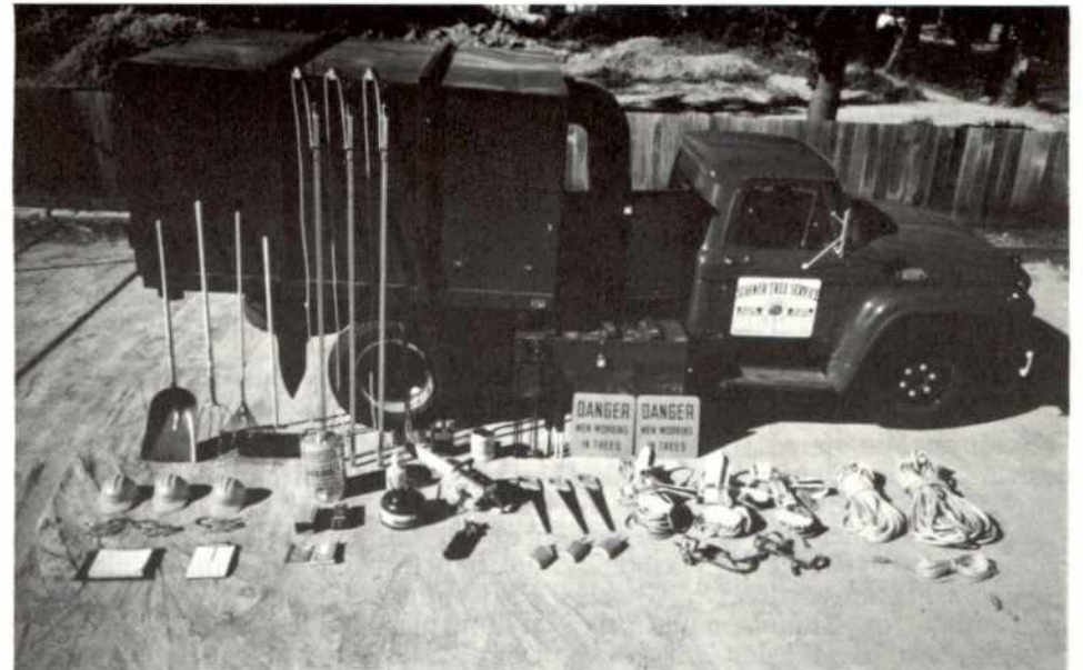
The photos above and below show new Sohner Tree Service clipper trucks being used in the North Bay Division by some of our members performing PG&E line clearing tree trimming.

The photos on pages four and five show the equipment our members use and also show the men on the job and at unit meetings.