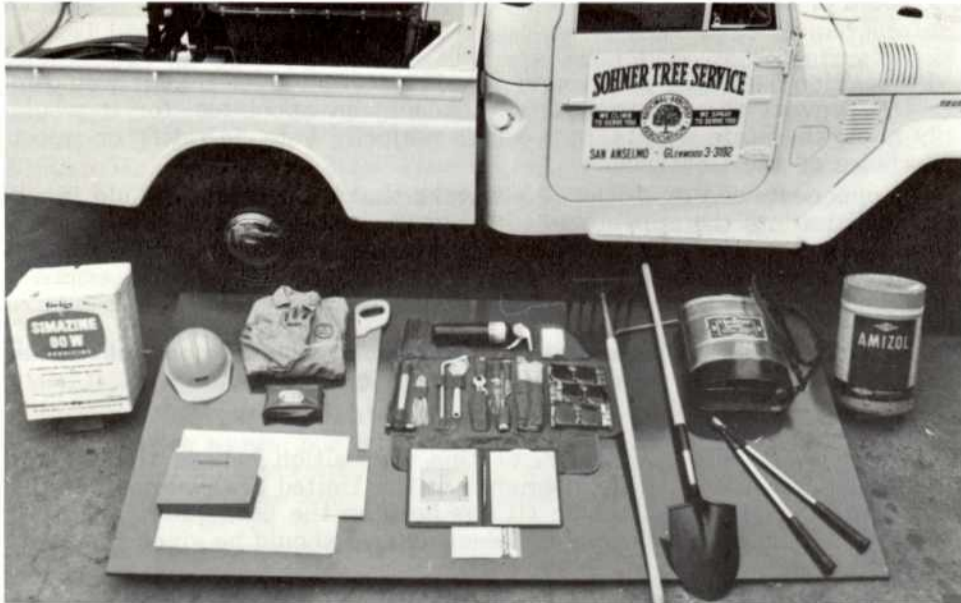
The photos above and below show the new spray trucks being used by some of our members employed by Sohner Tree Service.