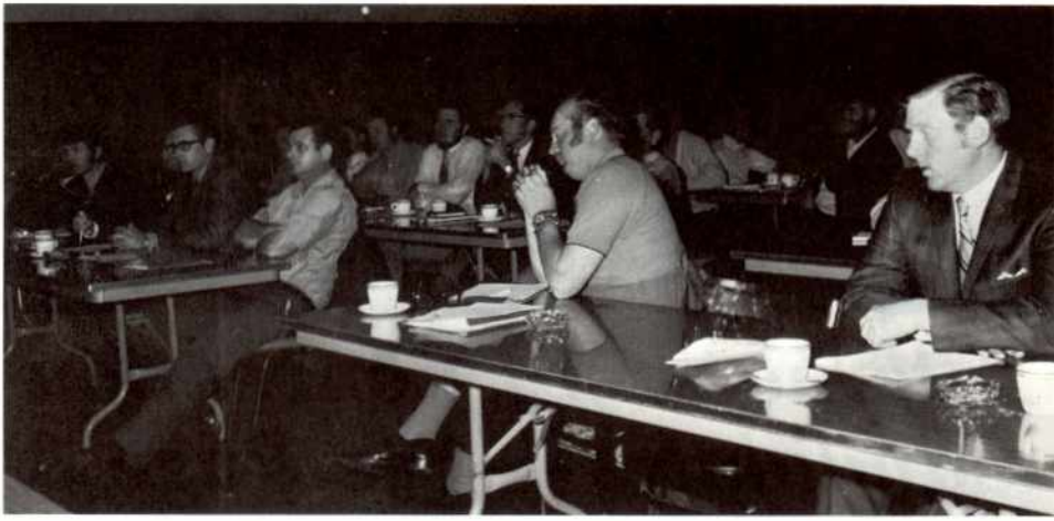
The above photo shows some of the Stewards in attendance at the General Construction Shop Stewards' Meeting held in Walnut Creek on May 9, 1970. The purpose of the meeting was to discuss the current negotiations and other general problems on the job. The attendance at the meeting was very good and we appreciate these men giving up a Saturday to improve their ability to function as a Steward.