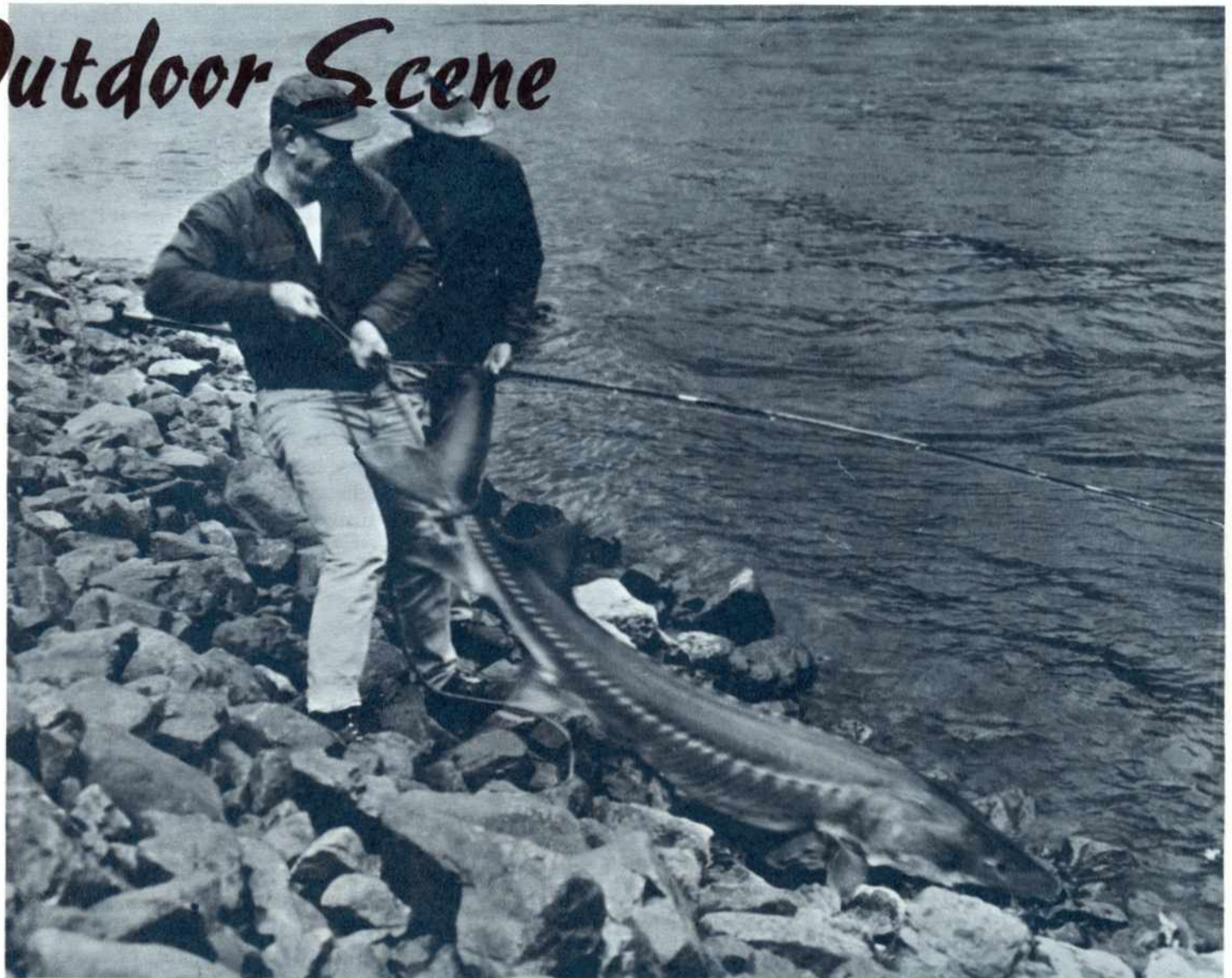
A fishing buddy helps angler "tail" a sturgeon and ease it onto the rocky banks of the Snake River.

The green sturgeon—one of the two western species, (the other, and major species, being the white sturgeon)—has already been eliminated in the Columbia above Bonneville, although liberal numbers once prevailed in one of its major tributaries, the Snake. Still holding forth in the Snake are remnant schools of white sturgeon which dwell in the deep dark waters of the dam-impoundment areas and in remote areas not ordinarily, fished by the masses.