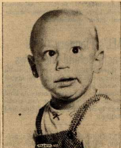
"How come I'm diggin' holes again this week?"

Insist on a Union Clerk when making your Christmas purchases.