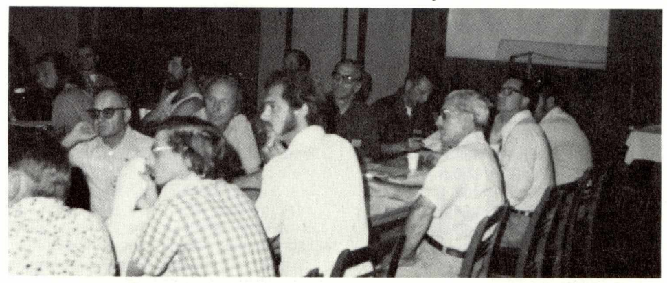
This photo shows more members in attendance at the Lodi meeting.