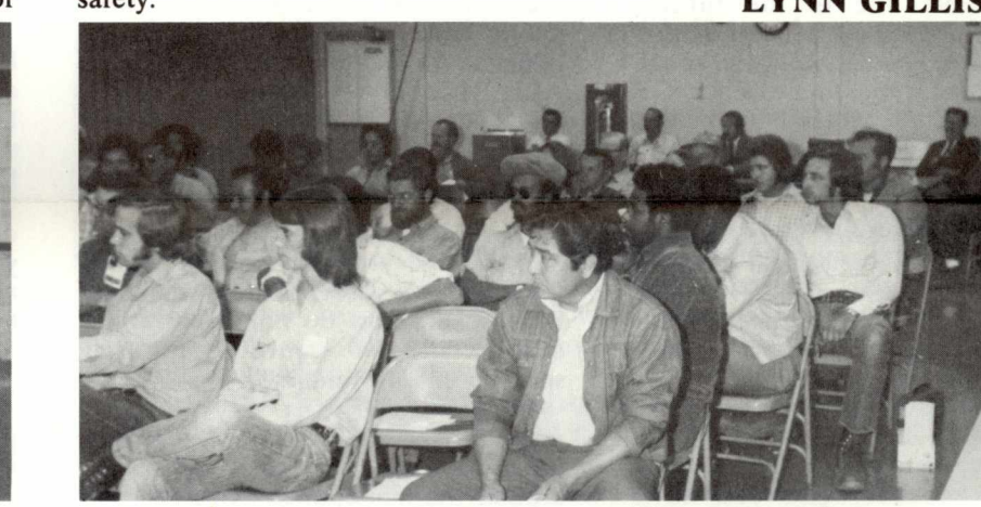
This photo shows some of the people at the PG& E safety meeting at Oakport.