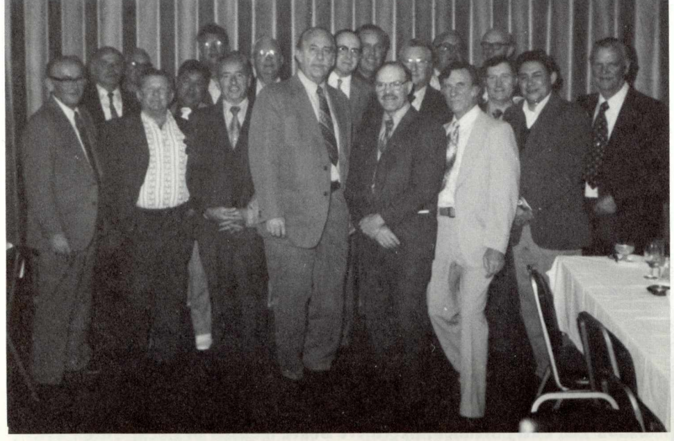
This photo shows the members of Local 1245 from the San Francisco area who received pins comemorating 20, 25, 30 and 35 years or more membership in Local 1245.