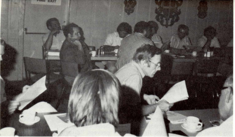
The photos above and below show members from the So. San Joaquin area at the training session in Bakersfield.