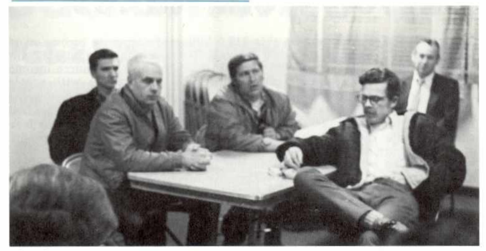
The photos above and below show more of those in attendance at the Elk Grove January Unit meeting. Congratulations on the excellent participation—keep it up.