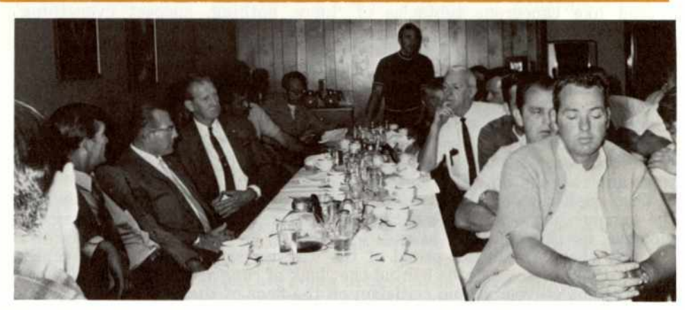
One of the Stewards is shown asking a question about the status of Agency Shop in the current negotiations.