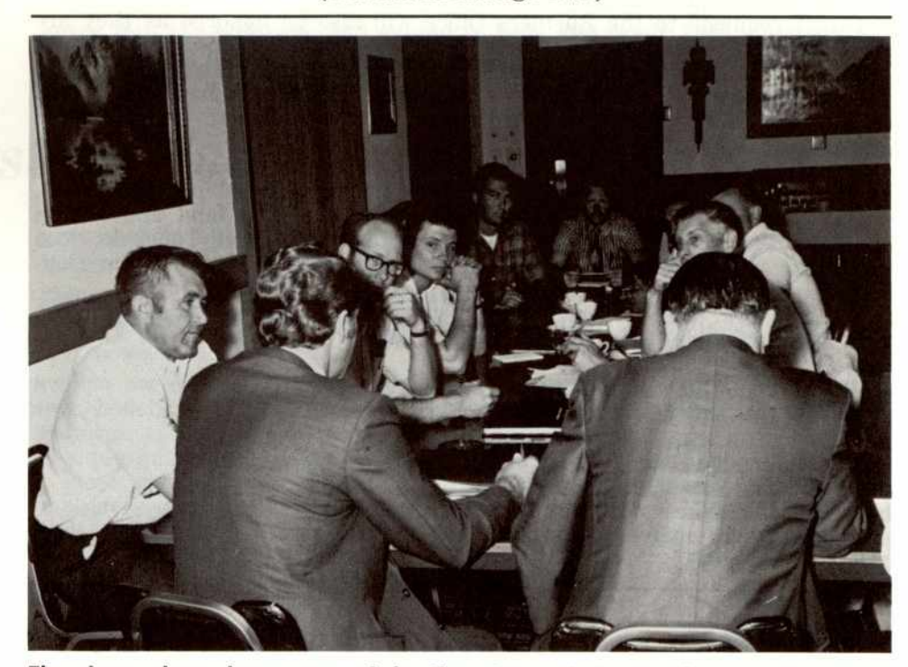
The above photo shows some of the Shop Stewards in attendance at the Shasta Division Stewards' Meeting. The main topic of the meeting centered around the current negotiations and there was some good discussion on this subject.