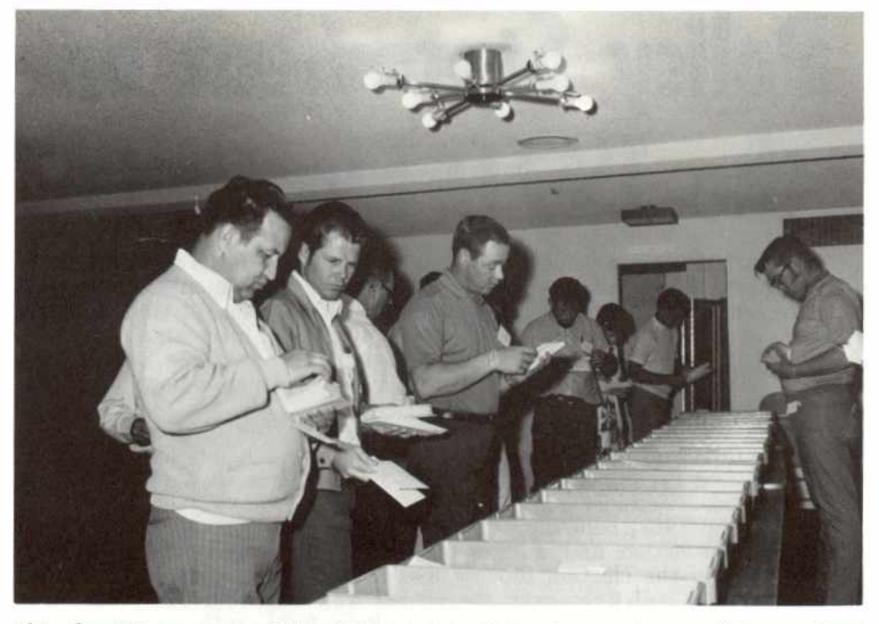
This photo shows some of the tellers alphabetizing the envelopes which contained the ballots which would determine who would be delegates to the International Convention of the I.B.E.W. This was just the beginning of a long hard task.

The U.S. Post Office Department recently opened a new and larger facility in Walnut Creek, and, effective July 1, 1970, has changed our Post Office Box Number and Zip Code as follows: P.O. Box 4790