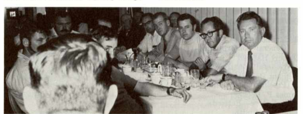
Both Physical and Clerical Stewards are shown in the photo above.

Corbett Wheeler closed the meeting by asking their continued support and thanking them for their continued activity in behalf of Local 1245.