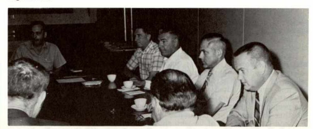
This photo shows more of the Shasta Division Shop Stewards.