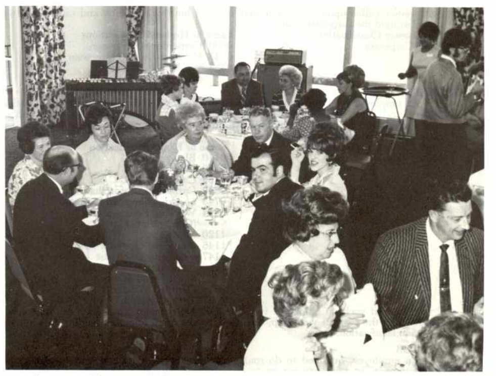
Another over-all view of the guests in attendance