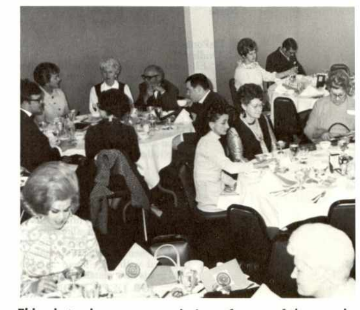
This photo shows a general view of some of the people

The setting for the show was beautiful in that the restaurant overlooks the San Francisco Bay. This, combined with the good looking models, the excellent music and the good food, made for a very enjoyable afternoon. This type of an event doesn't