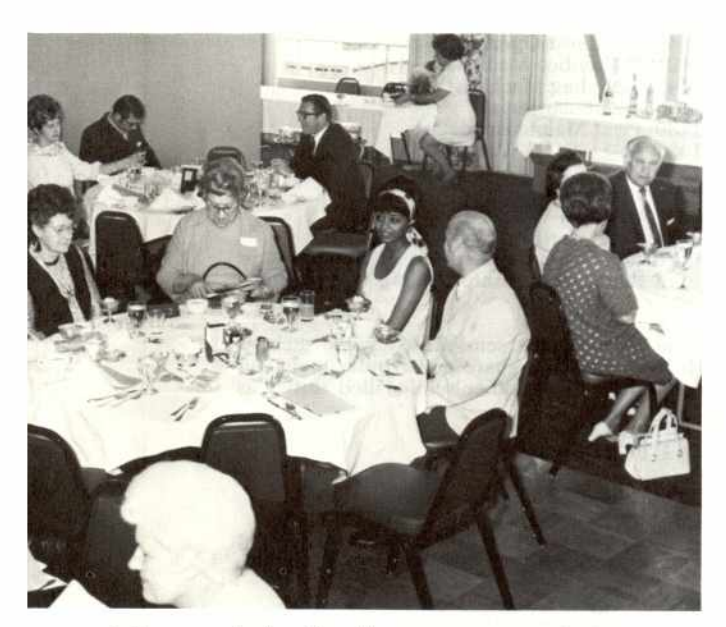
some of the people in attendance.