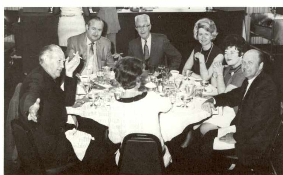
This photo shows some of the guests from the Union headquarters.