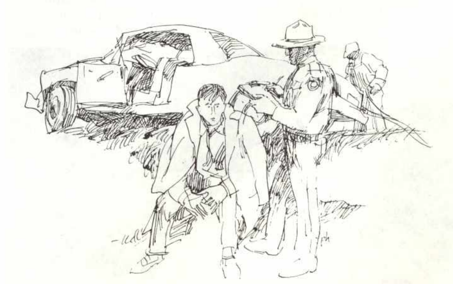
It is a reflection of a distorted sense of values when we can spend, as we did in 1966, $150 million on highway beautification and only about $10 million on highway safety, author Ralph Nader writes in the current issue of Agenda Magazine, published by the AFL-CIO Industrial Union Department. Next year, he says, will be the first in which the federal government will spend more on traffic safety than the safety of migratory birds.

In any case, we seem to have both as we begin a New Year.