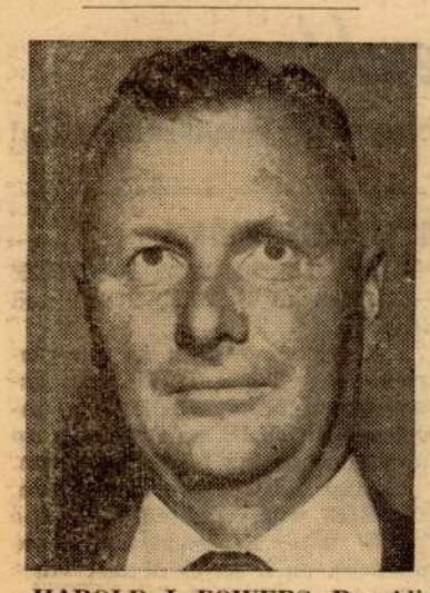
HAROLD J. POWERS, Republican Incumbent.

Mr. ROYBAL, during his tenure as L.A. City Councilman, has supported the following legislation: 1. Retention of rent controls; 2. Improved wages and working conditions for L.A. City Employees. 3. Funds for additional playgrounds and improvements on existing facilities. 4. Smog control program. 5. Improved library facilities. 6. Compulsory Fair Employment Practice (non-discrimination) for L.A. City Employees. 7. Improved police, health and traffic services for the 2 million residents of Los