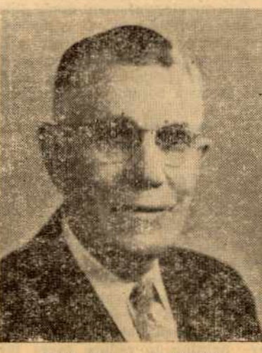
SEN. ED C. JOHNSON