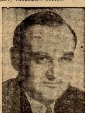
EDMUND G. "PAT" BROWN, Democratic Incumbent...

The background of the major party candidates follows.