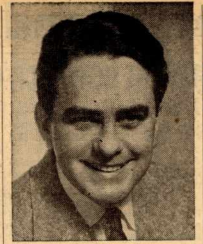
cial rights of working men and women.

SHORT is pledged to support the platform of his party and to work for improvements in laws which affect the economic and so-