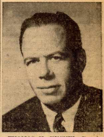
THOMAS H. KUCHEL, Republican Incumbent.

"No amount of deceptive, highpowered propaganda can fully obscure the need to clean up the current mess in Washington. This can only be accomplished through a resounding Democratic victory."